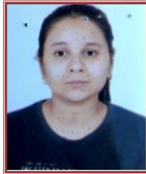
II Vaishnavi (82.02%)